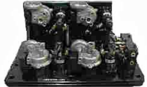
HYDRAULIC OPERATED HARD FIXTURE FOR VERTICAL MACHINING CENTER WITH TWO OP. 1 AND TWO OP. 2 WORKPIECES

MULTIPLE PARTS CAN BE MACHINED ON EACH OF THE FOUR SIDES, ALLOWING MACHINING ACCESS TO THREE SIDES OF THE WORKPIECE.