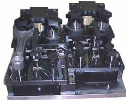
HARD FIXTURE FOR VERTICAL MACHINING CENTER