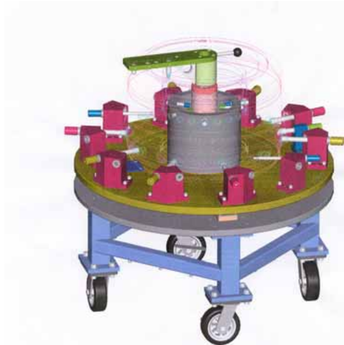
INSPECTION FIXTURE FOR TURBINE ENGINE PLENUM