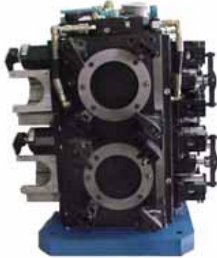
FOUR SIDED TOMBSTONE FIXTURE WITH INTERCHANGEABLE FACE PLATES AND INTERNAL PLUMBING