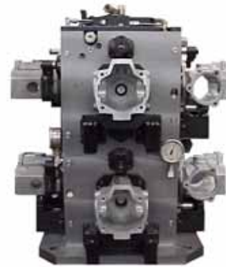
FOUR SIDED TOMBSTONE FIXTURE WITH INTERNAL PLUMBING TO REDUCE CHIP TRAPS