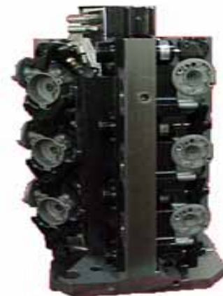
THREE SIDED TOMBSTONE FIXTURE